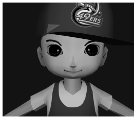
Figure 2. One of the human models that the user may choose from

The playable introduction will be studying the affects of adaptability within games for children. By having multiple model sets of different virtual characters, we hope to catch the attention more thoroughly of the intended users. We have consulted with various experts on autism who have all stated that while every autistic child is unique, there are some obsessions that are seen very frequently among them including trains, dinosaurs, and insects. We believe that these themes will also engage normally developed children, and we plan to have sets of anthropomorphic character models for each of them, as well as a human set, and allow the user to select their favorite.